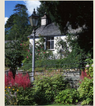
Dove Cottage , home of William Wordsworth from December 1799 to May 1808

In the afternoons we'll have optional field trips: rambling in the fells, visiting Wordsworth's Grasmere, paying homage to Beatrix Potter's cottage, indulging in "cream tea," or visiting old bookshops and pubs. Our evenings will be spent relaxing at the inn and spa with our community of fellow children's book creators.