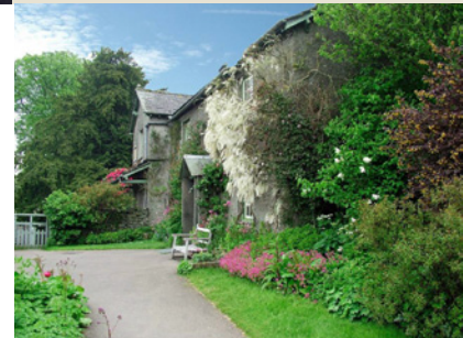
Hill Top , home of Beatrix Potter, Near Sawrey, Cumbria

Art Supplies Bring a few pencils (graphite and/or a small set of colored pencils), erasers, pens, watercolors (travel set), a couple of brushes, handy-sized watercolor block or pad, and sketch pad. For discount supplies, visit the following online retailers: dickblick.com or cheapjoes.com or jerrysartarama.com . We will supply more information regarding supplies via e-mail in early 2012.